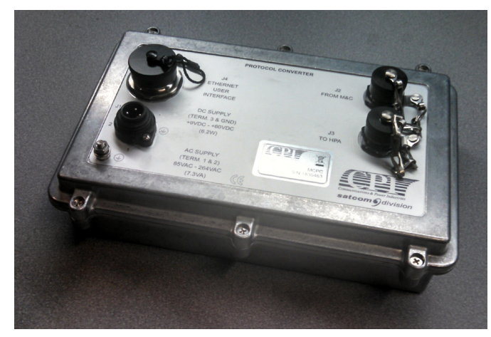
CPI Model IMM-SNMP, SNMP Management Module for satellite uplink applications